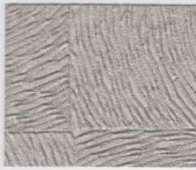
COS 006 (LRV = 42)