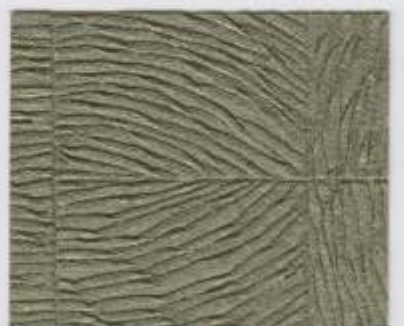
COS 020 (LRV = 17)