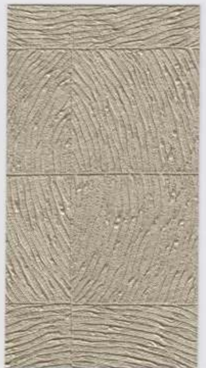
COS 018 (LRV = 34)