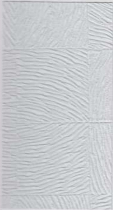
COS 001 (LRV = 68)