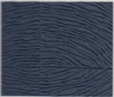
COS 004 (LRV = 6)