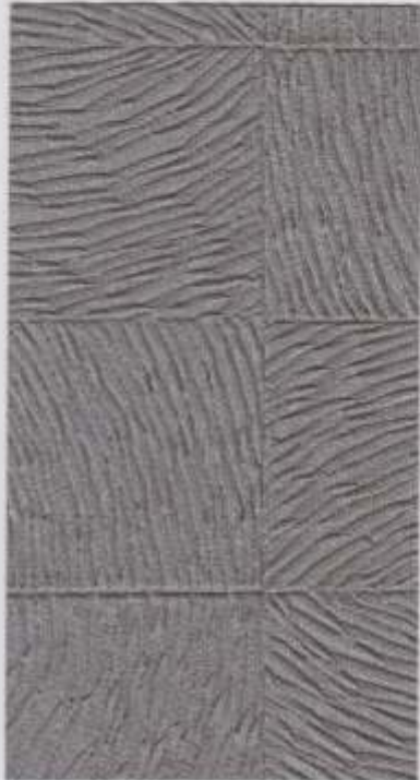
COS 007 (LRV = 21)