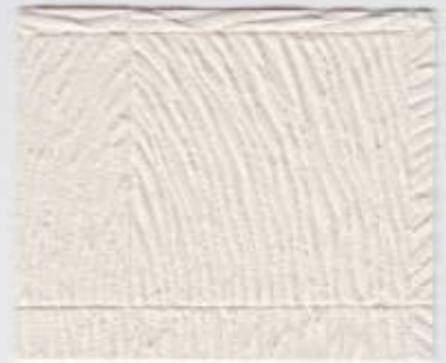
COS 017 (LRV = 72)