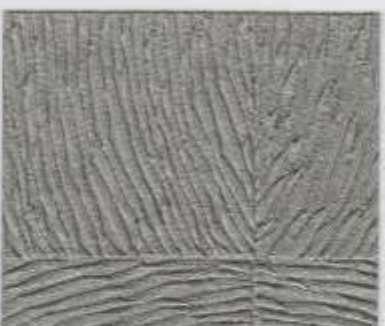
COS 019 (LRV = 24)