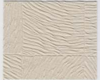
COS 021 (LRV = 53)