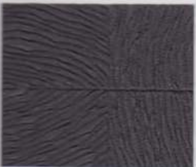
COS 008 (LRV = 6)