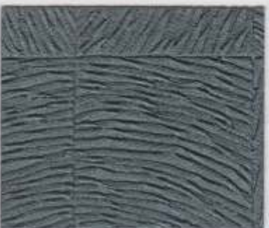
COS 003 (LRV = 11)